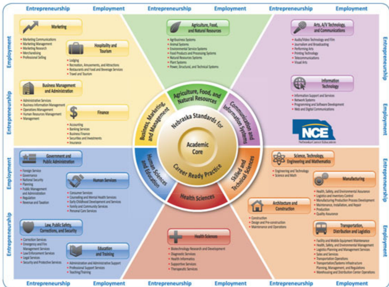
Adapted from NASDCTEC/NCTEF Career Clusters: Pathways to College and Career Readiness. Developed by the Nebraska Department of Education 2012.