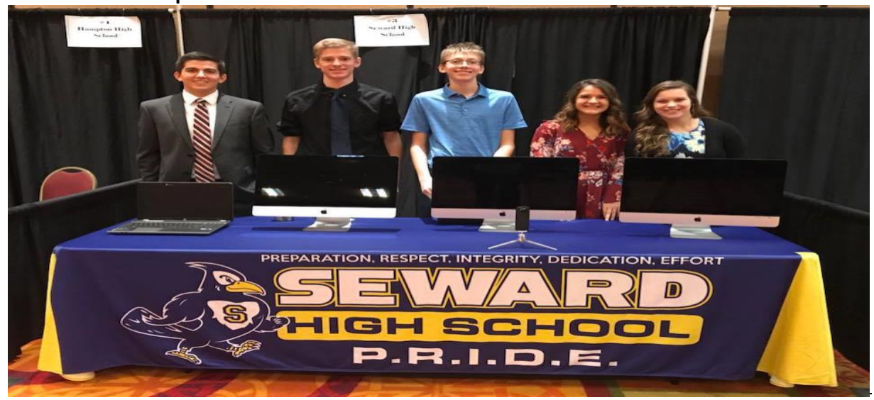
Seward Public Schools Every Student-Every Day-A Success